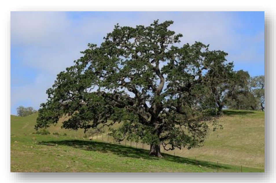
Valley Oak Youth Academy – The Valley Oak tree is native to the Sacramento area. It symbolizes lasting strength and endurance. The acorn of the tree symbolizes unlimited potential that something so small has the potential to grow into a large majestic oak tree. A tree mural is painted in the program-housing unit.

During initial orientiation, a tree-focused activity identifies all the supports youth have when they enter the program. This visual tree continues to "branch" out with additional supports (e.g. family, advocates, providers, teachers, etc.) as they progress through the program. When youth leave the program, the visual reminds them they are not alone, they have support from many areas of their life, and they are growing into strong individuals capable of making healthy positive decisions that benefit themselves and the community.