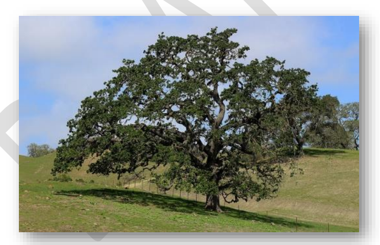
Valley Oak Youth Academy – The Valley Oak tree is native to the Sacramento area. It symbolizes lasting strength and endurance. The acorn of the tree symbolizes unlimited potential that something so small has the potential to grow into a large majestic oak tree. A tree mural is painted in the program-housing unit.

During initial orientiation, a tree-focused activity identifies all the supports youth have when they enter the program. This visual tree continues to "branch" out with additional supports (e.g. family, advocates, providers, teachers, etc.) as they progress through the program. When youth leave the program, the visual reminds them they are not alone, they have support from many areas of their life, and they are growing into strong individuals capable of making healthy positive decisions that benefit themselves and the community.