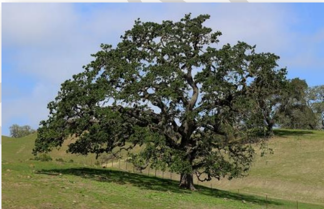
Valley Oak Youth Academy – The Valley Oak tree is native to the Sacramento area. It symbolizes lasting strength and endurance. The acorn of the tree symbolizes unlimited potential that something so small has the potential to grow into a large majestic oak tree. A tree mural is painted in the program-housing unit.

During initial orientation, a tree-focused activity identifies all the supports youth have when they enter the program. This visual tree continues to “branch” out with additional supports (e.g. family, advocates, providers, teachers, etc.) as they progress through the program. When youth leave the program, the visual reminds them they are not alone, they have support from many areas of their life, and they are growing into strong individuals capable of making healthy positive decisions that benefit themselves and the community.