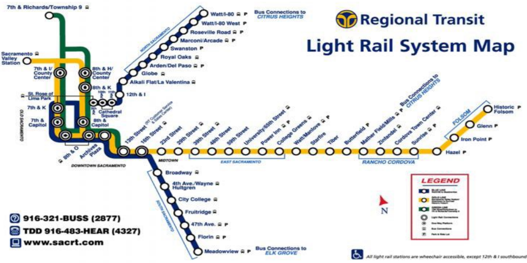
MAP of DOWNTOWN SACRAMENTO